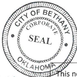
KP WESTMORELAND MAYOR