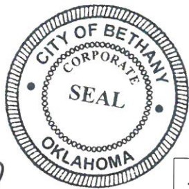
KP Westmoreland Mayor