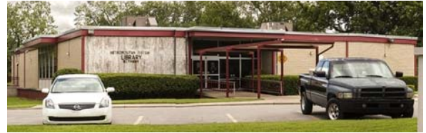
Old Library Photo

We are working with MLS to install a live web-camera next week on the police station to record the demolition of the old library, as well as the construction of the new library. A link to this will be added to the Bethany website.